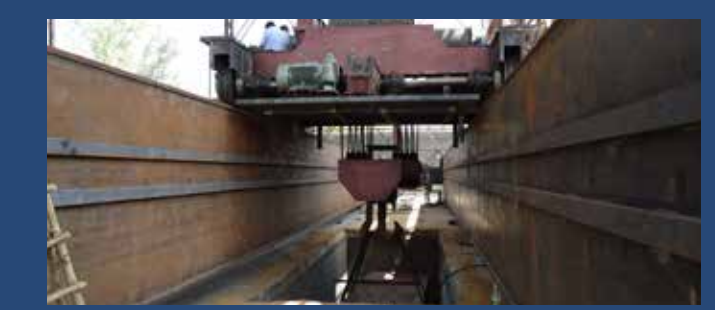
Load Testing Facility