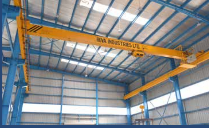
Reva Single Girder Cranes in Fabrication Shop