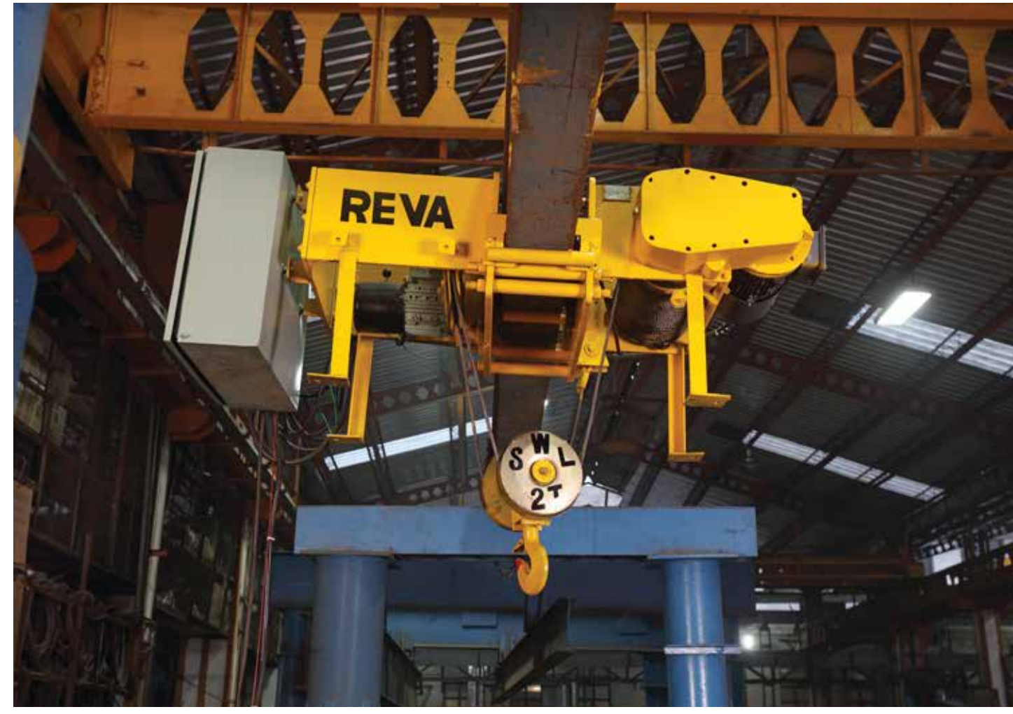
2T, 10M Lift Low Headroom Hoist

Reva Hoists are designed as per IS 3938 and confirm to FEM standards. We specialize in customized hoists like Curved Path hoists/ Low Headroom hoist / Ultra Low Headroom hoist /Explosion proof (flameproof) Atex certified hoist/ creep speed through VVVF arrangement hoist / Synchronous Tandem operated Hoist/ Radio Remote controlled Hoist / Wall Mounted Panel type Hoist / Foot mounted hoist/ Magnet Handling hoist.