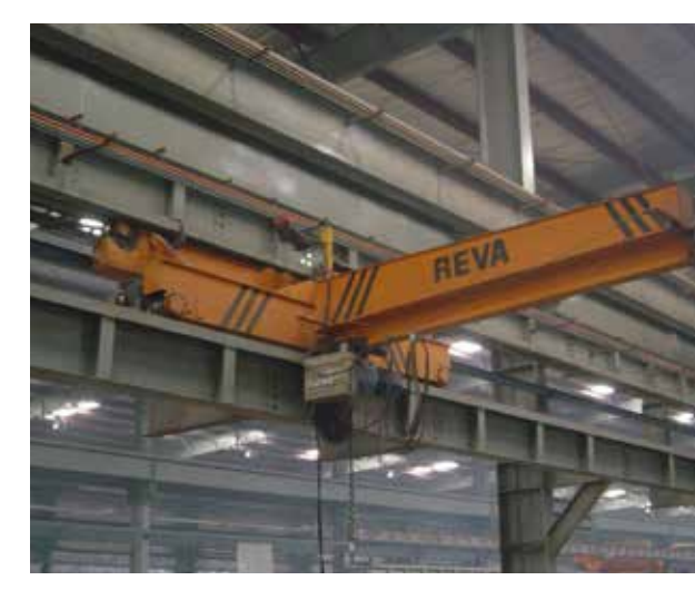
Wall Travelling Jib Crane 2T Capacity at Kirby Building