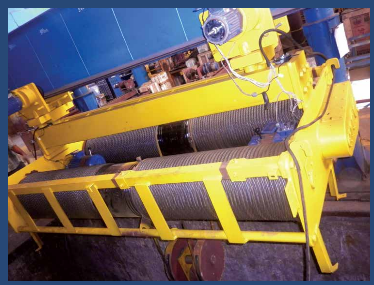
High Lift Hoist (Double Drum Type)18T, 54M Lift Hoist for BHEL - YERMARUS Project