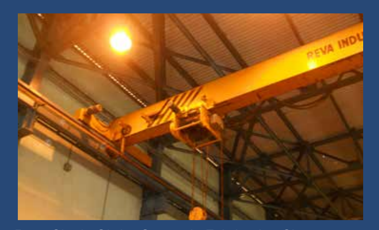
Reva Single Girder Cranes in Fabrication Shop