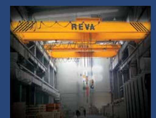
120T EOT Crane & 100T EOT Crane