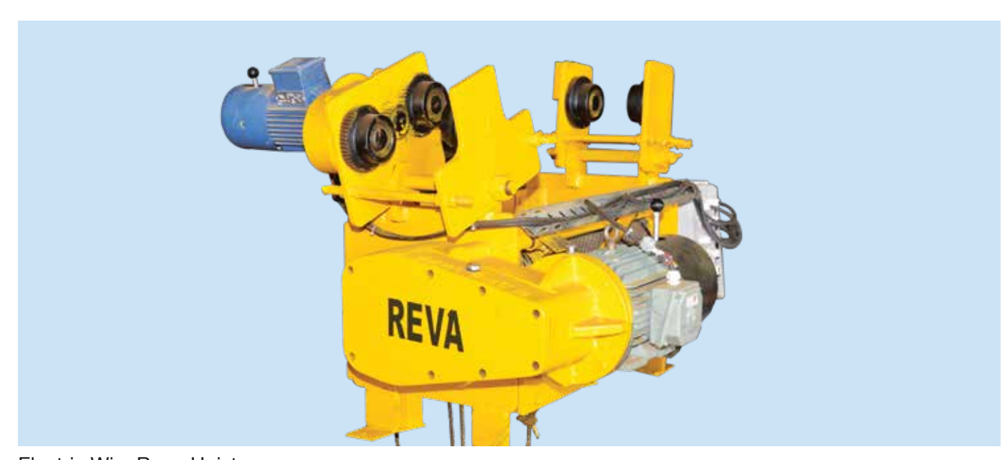
Electric Wire Rope Hoist

Whether it is selecting an Overhead Crane Kit or learning how to Wire an Overhead Crane Kit, or how to manufacture girders, we can help.