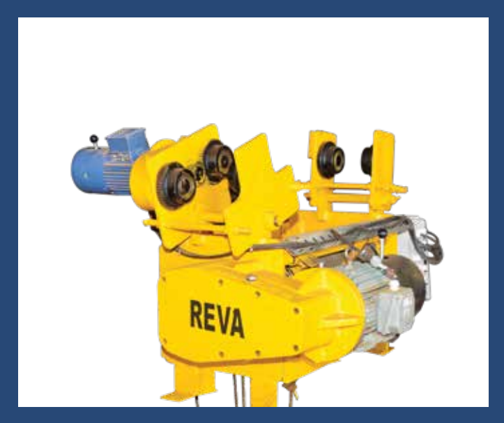
Reva Compact Hoist