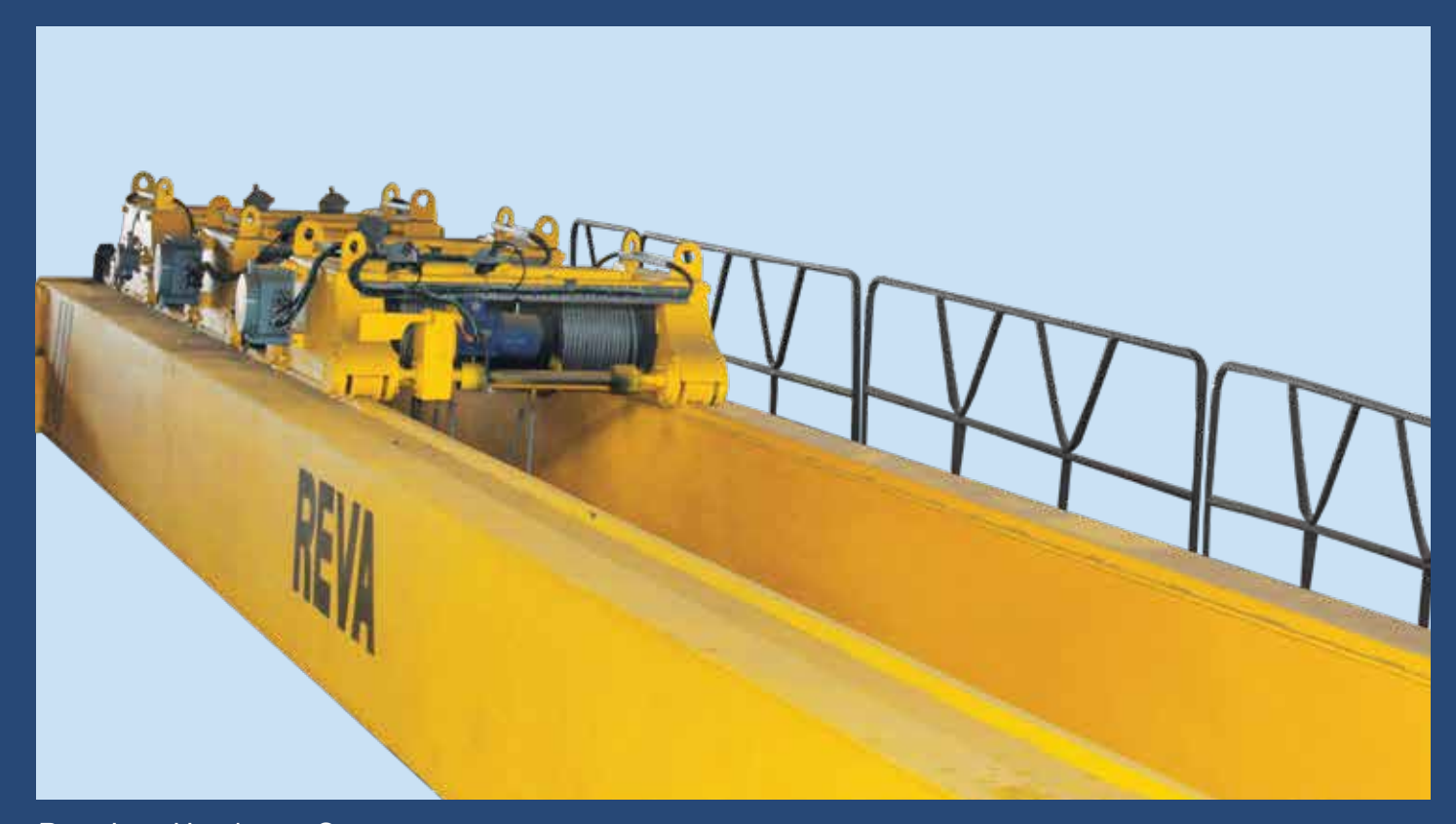
Reva Low Headroom Crane

Reva Low Head Room Crane designed to have Lower Headrooms and more Hook approaches. It is good to save on the building costs by reducing heights of the building and can cover more floor area. It also finds its use in existing buildings where overhead clearance is less and lifting height requirements are stringent. It has capacities ranging from 1 Ton to 25Ton.