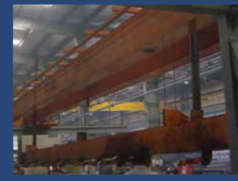
Stacker Cranes at Kirby Building Systems