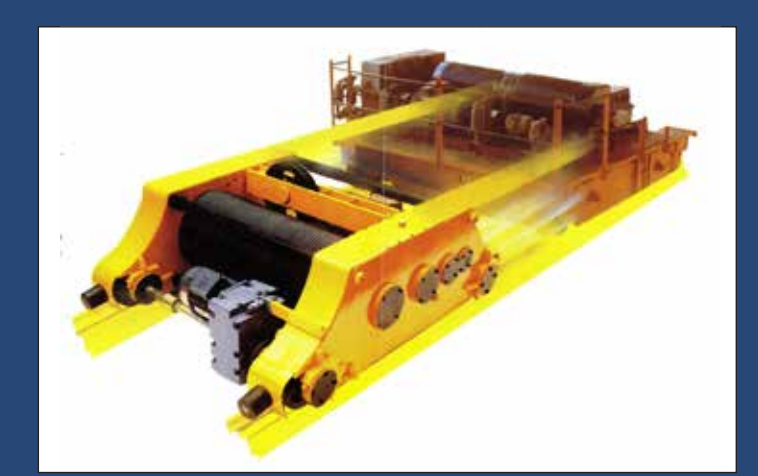
Space saving comparison of LH Crane to conventional Crane.