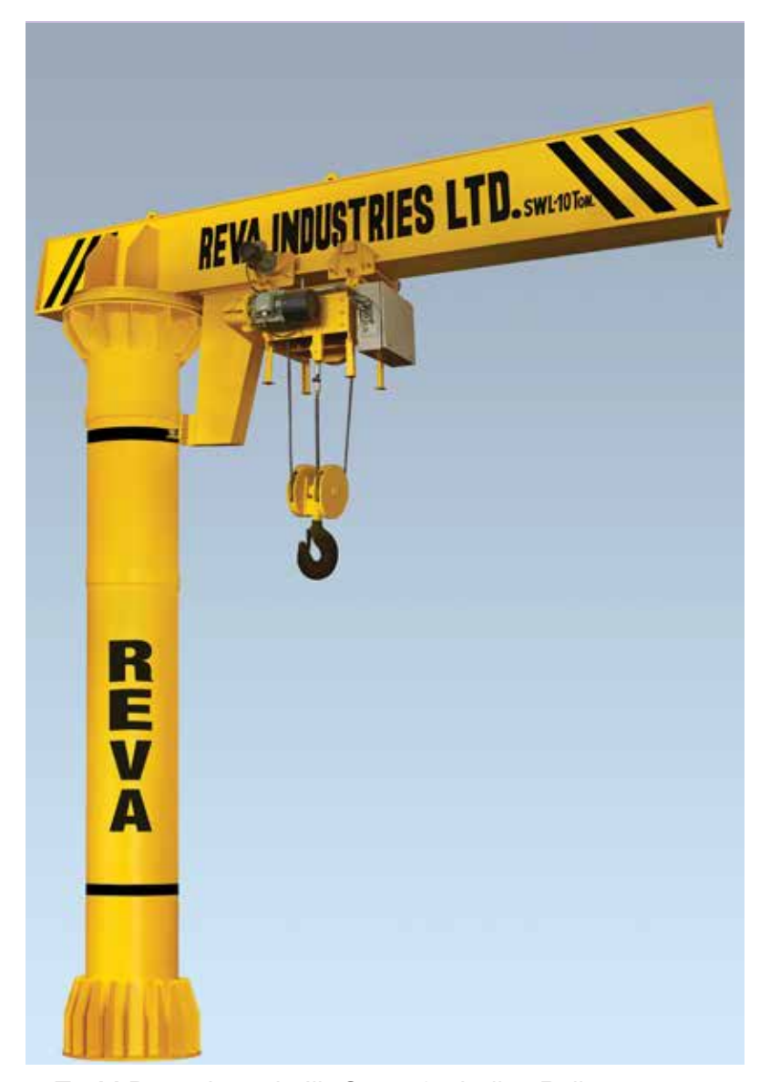
10T, 5M Boom Length Jib Crane for Indian Railway

They can be hand operated also but, electrically operated Cranes with Electric Wire Rope Hoists, are the order of the day for increasing the production. The lifting capacity could be in the range of 1 Ton to 10 Tonnes.