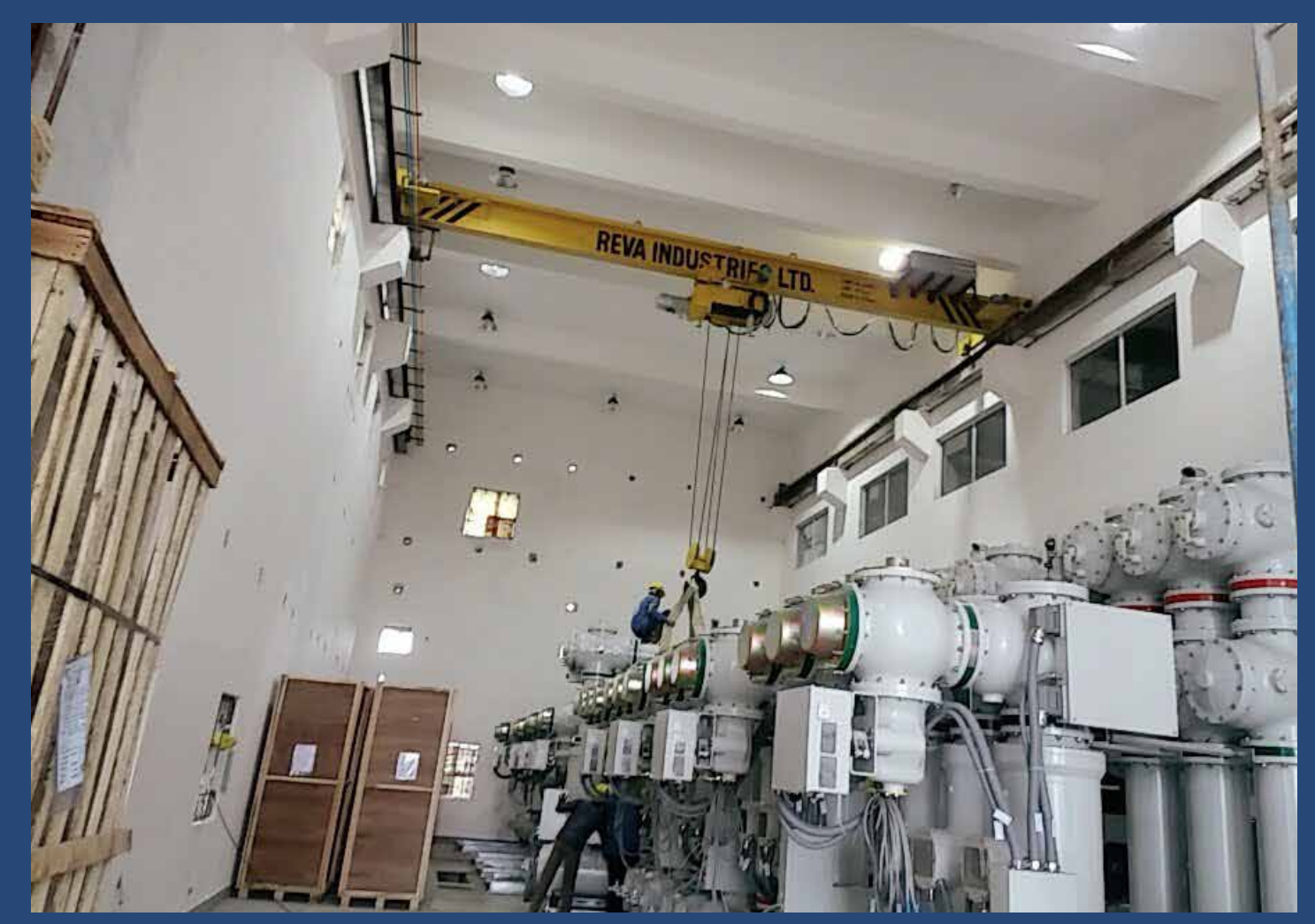
Single Girder Crane for GIS Application for PGCIL

We have designed and supplied Single Girder Cranes up to 25T Capacity, and 25 M Span.