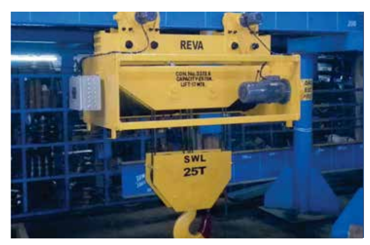
25T, 17M Lift Electric Wire Rope Hoist