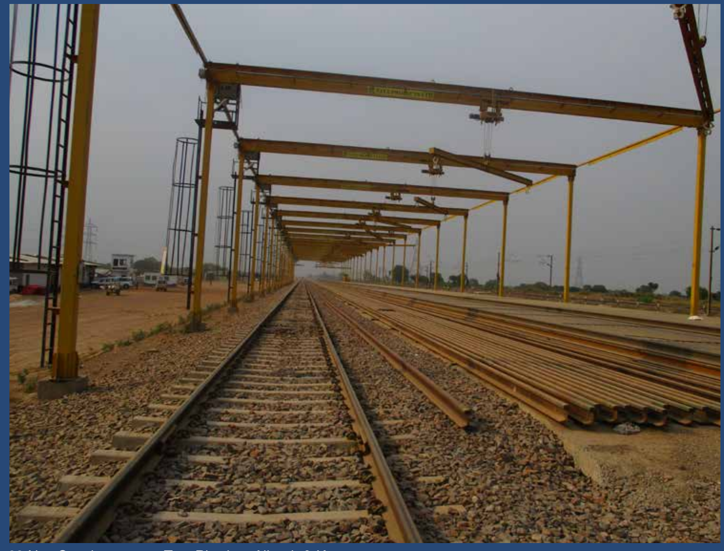
63 Nos Synchronous at Tata Bhadan, Aligarh & Kanpur

Reva provides Customization solution to the customers