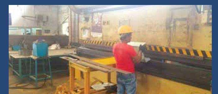
Sheet Metal Shop