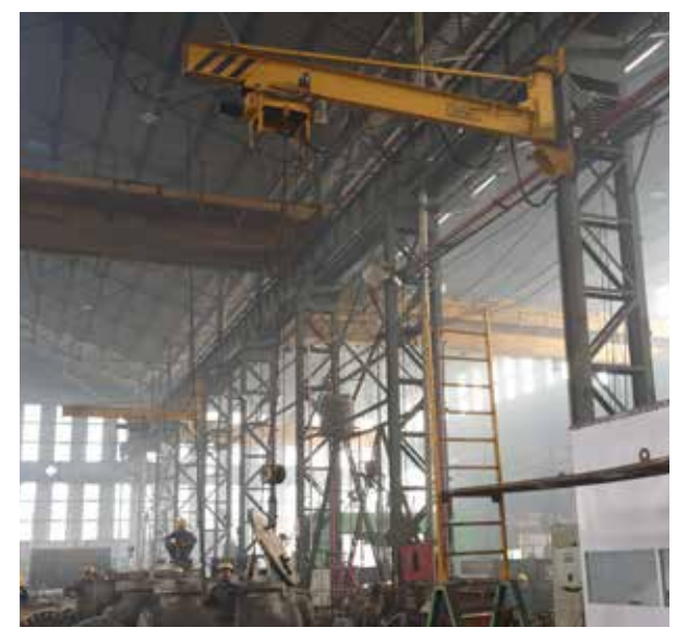
1T, 3M Boom Length for a Fabrication Shop