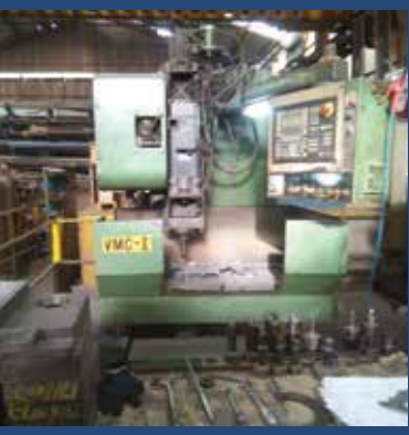
VMC Machine Shop