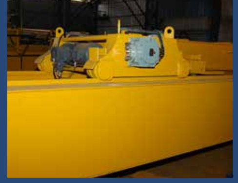
10T Hazardous Area Crane for IOCL