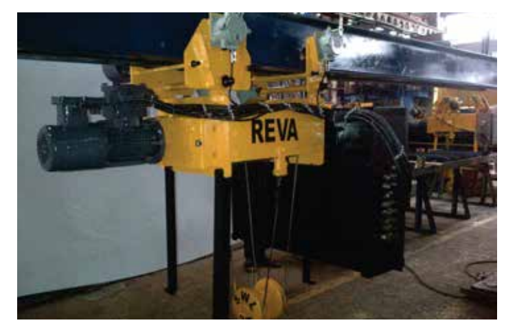
Flameproof Hoist - 5T capacity Hazardous area for Zone 1 & 2 (gas) and Zone 21 & 22 (dust) suitable for both areas