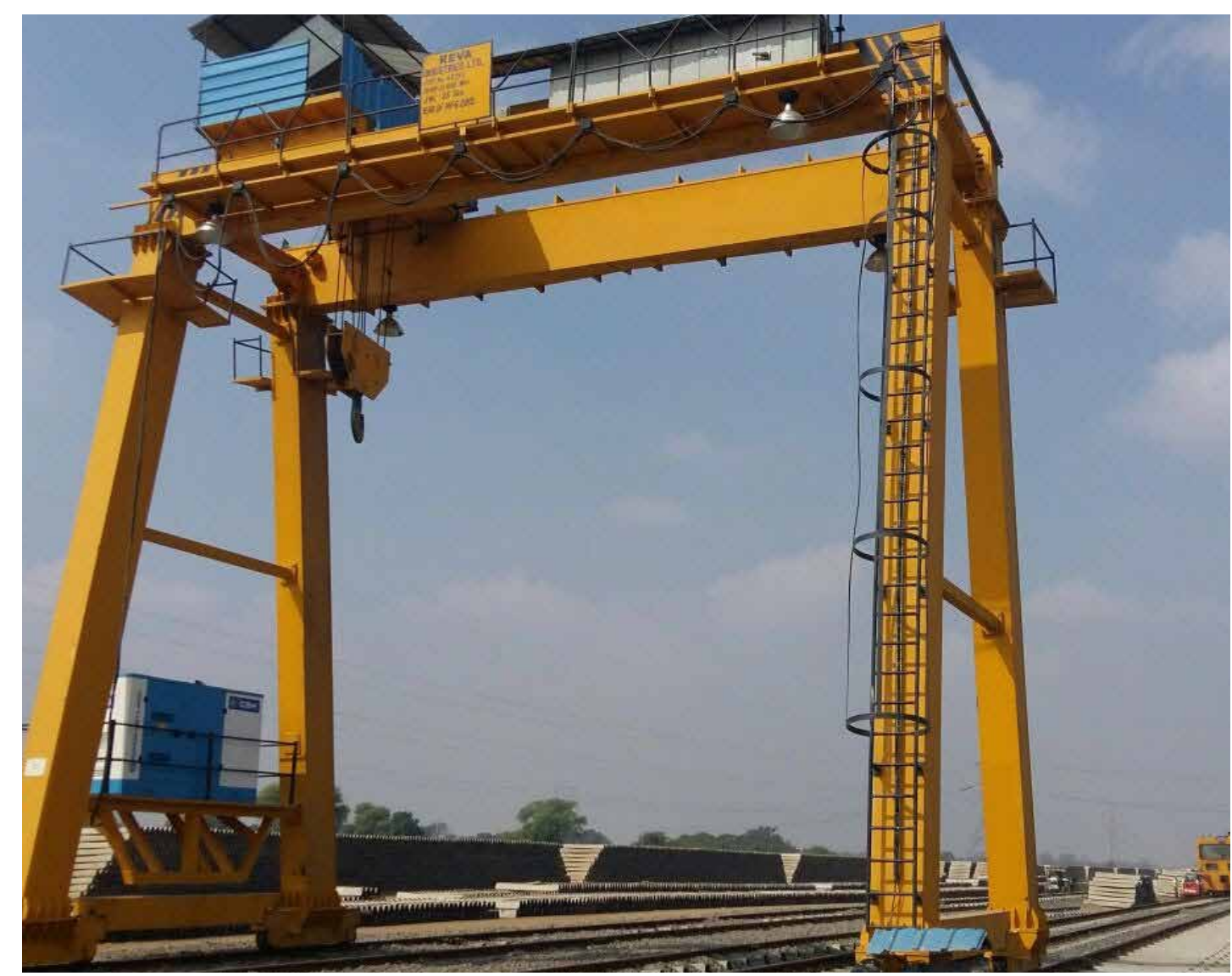
35T Goliath Crane at Tata Bhadan, DFCC

Gantry Cranes, often called Goliath Cranes or Portal Cranes, are suitable for indoor and outdoor usage. They are self standing members (they are cranes with legs), and do not require support from walls or rigid columns of buildings. They are available in a wide range of capacities between 1T till 150T. They are majorly used in open ware houses or buildings where the column or structure is weak.