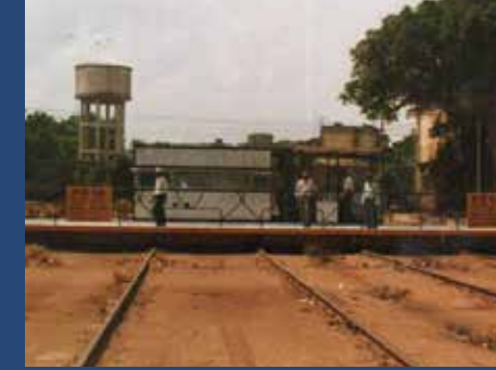
75T Traverser at Railways