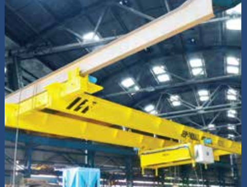
5T, 62M Lift for NTPC Barh Double Girder Underslung Crane