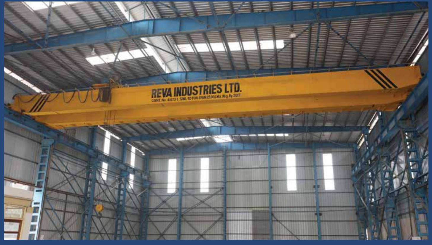
10T, 27M Crane at a Fabrication Shop

Designs for Circular Path of travel, Cranes for Hazardous Areas (Atex Certified), Underslung Cranes are also manufactured.