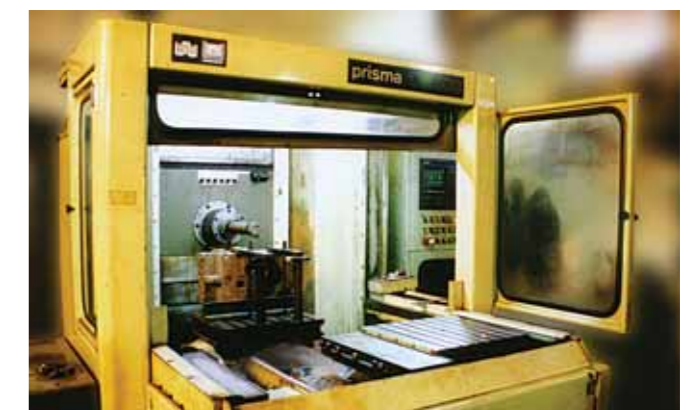
MACHINING ON MACHINING CENTRE