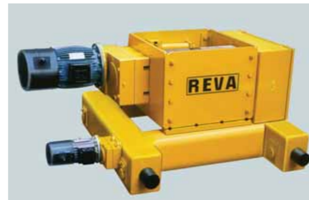
BI - RAIL HOIST