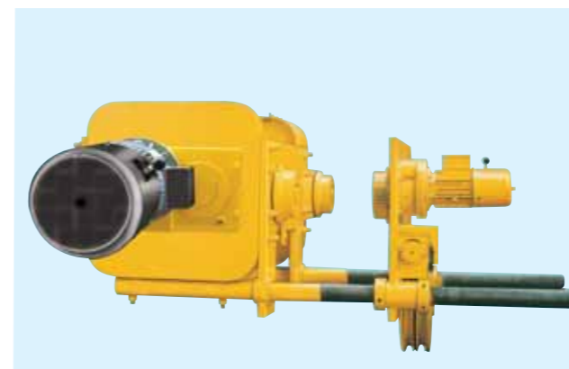
ULTRA LOW HEAD - ROOM HOIST