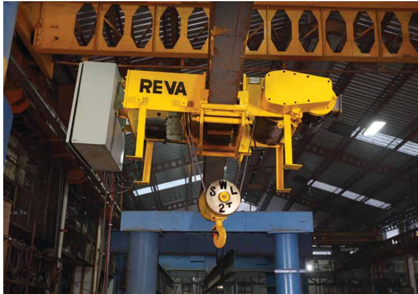
2T, 10M Lift Low Headroom Hoist

Reva Hoists are designed as per IS 3938 and conform to FEM standards. We specialize in customized hoists like Curved Path hoists/ Low Headroom hoist / Ultra Low Headroom hoist /Explosion proof (flameproof) ATEX certified hoist/ creep speed through VVVF arrangement hoist / Synchronous Tandem operated Hoist/ Radio Remote controlled Hoist / Wall Mounted Panel type Hoist / Foot mounted hoist/ Magnet Handling hoist.