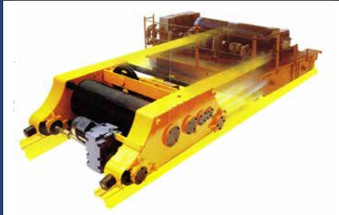
Space saving comparison of LH Crane to conventional Crane.