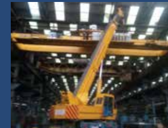
40T DG EOT Crane Dahod Railways, Gujarat Installation