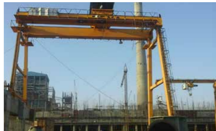
45T + 5T Triple Leg Goliath Crane at NTPC Vindhyachal