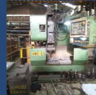
VMC Machine Shop