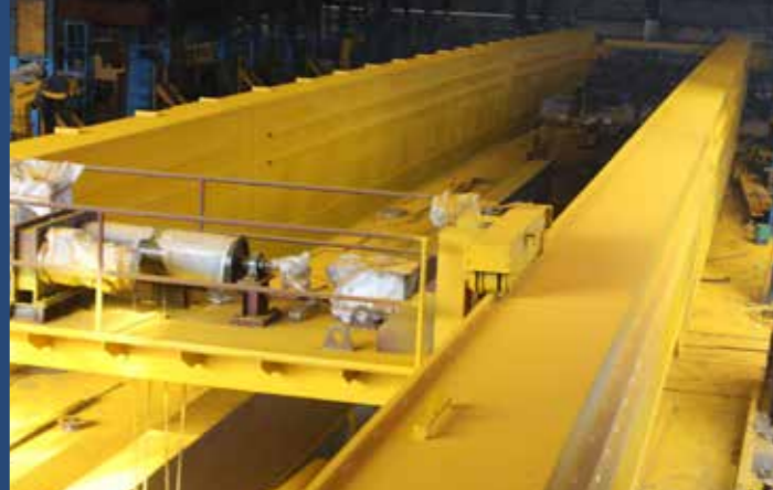
Fish-Belly design - for very Low Headroom Crane Capacity 7.5T Crane 50M Span for Defence