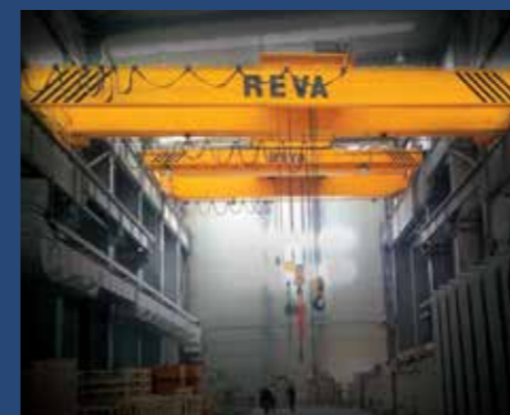
120T EOT Crane & 100T EOT Crane

Reva's Double Girder EOT Cranes are fine examples of practical, intelligent, reliable, economical and balanced solutions for Overhead Handling of loads. Be it for a foundry shop or a godown, our cranes have been designed and manufactured for all needs. By embracing high level of standardisation and continuous evolution of our components for the past 5 decades, we have come to serve an honourable clientele, which includes, BHEL, SAIL, Tata, L&T and many more.