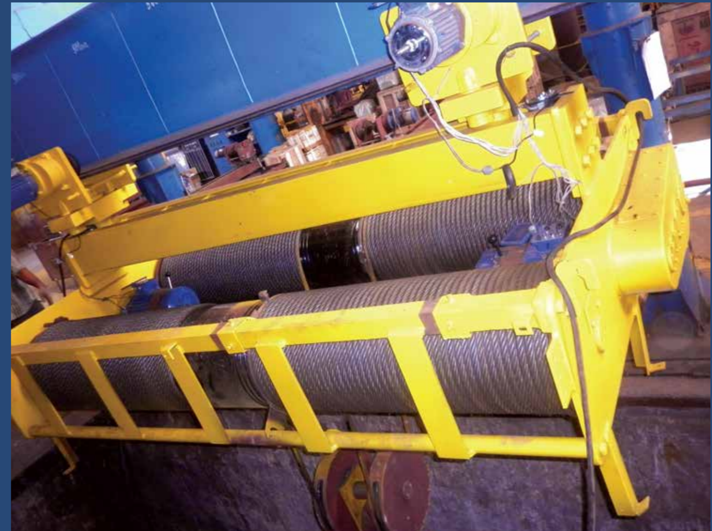
High Lift Hoist (Double Drum Type)18T, 54M Lift Hoist for BHEL - YERMARUS Project