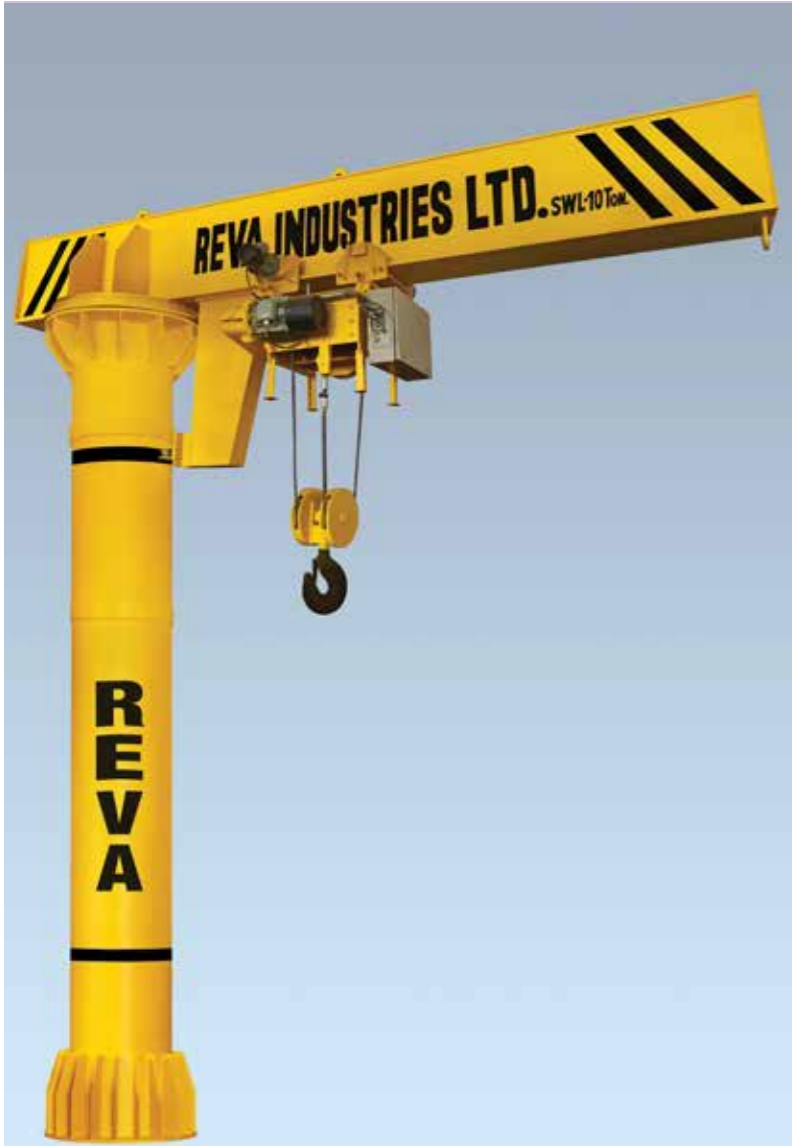
10T, 5M Boom Length Jib Crane for Indian Railway

They can be hand operated also but, electrically operated Cranes with Electric Wire Rope Hoists, are the order of the day for increasing the production. The lifting capacity could be in the range of 1 Ton to 10 Tonnes.