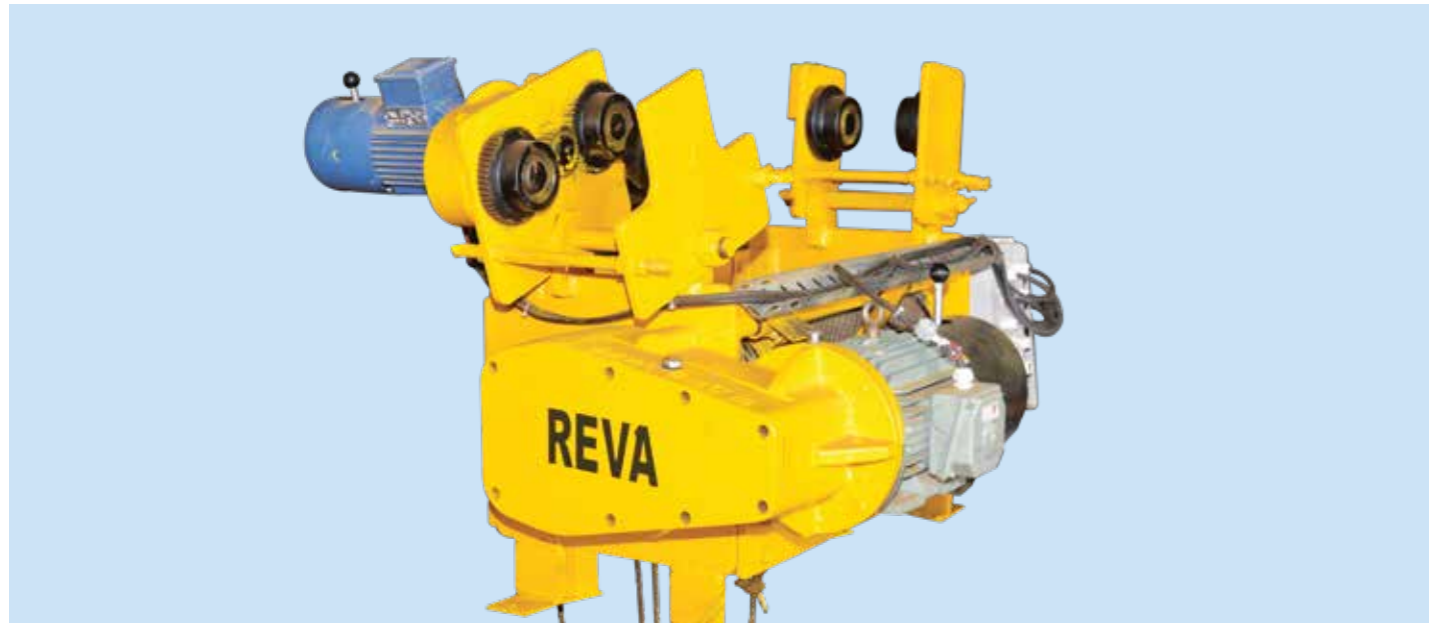
Electric Wire Rope Hoist

Whether it is selecting an Overhead Crane Kit or learning how to Wire an Overhead Crane Kit, or how to manufacture girders, we can help.