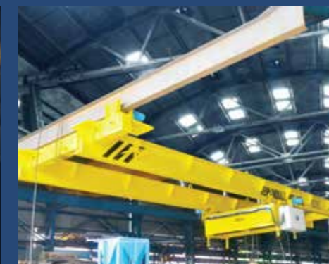
5T, 62M Lift for NTPC Barh Double Girder Underslung Crane