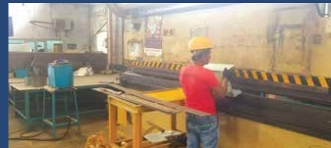
Sheet Metal Shop