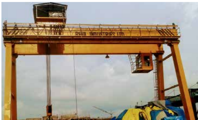
60T Goliath Crane at NTPC Mauda