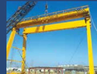
60T, Goliath Crane at Raigarh, Chhattisgarh Installation