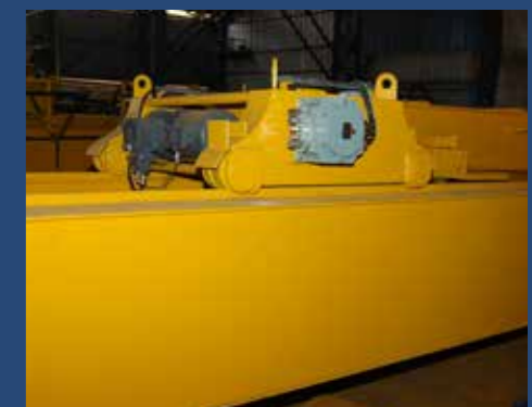
10T Hazardous Area Crane for IOCL