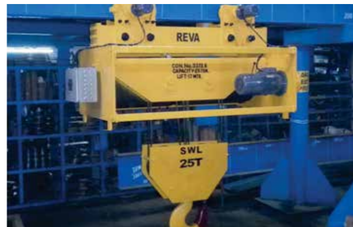
25T, 17M Lift Electric Wire Rope Hoist