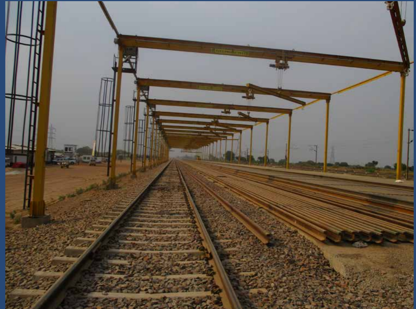
63 Nos Synchronous at Tata Bhadan, Aligarh & Kanpur

Reva provides Customization solution to the customers