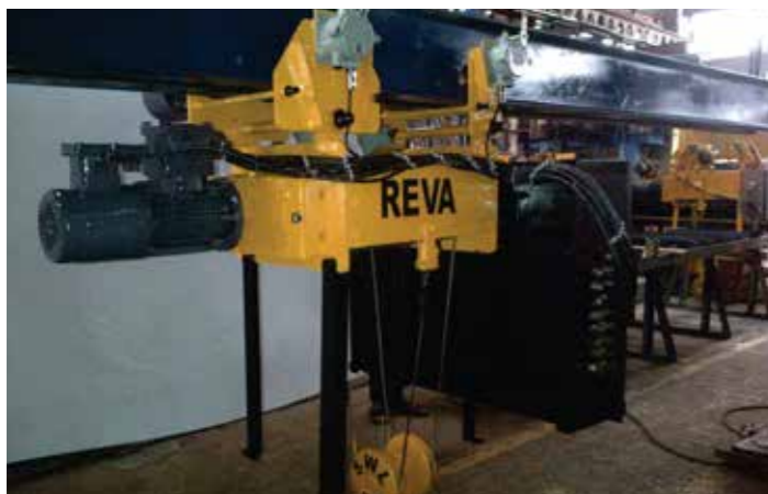
Flameproof Hoist - 5T capacity Hazardous area for Zone 1 & 2 (gas) and Zone 21 & 22 (dust) suitable for both areas