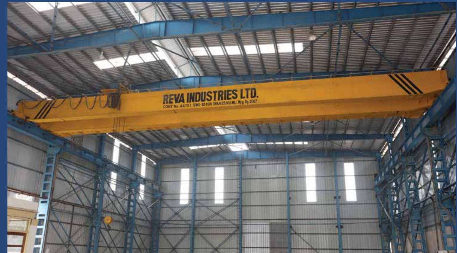
10T, 27M Crane at a Fabrication Shop