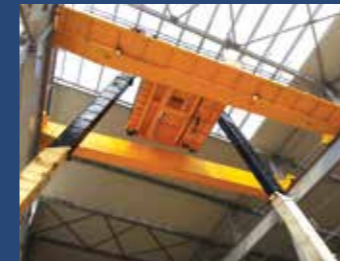
120T, DG EOT Crane Rajasthan, Erection & Installation

We provide complete service facility to our valuable customers. Specialist engineers are available for troubleshooting, erection & commissioning, supervision and complete overhauling of cranes. We deal in all types of spares of cranes, AMC and maintenance work.