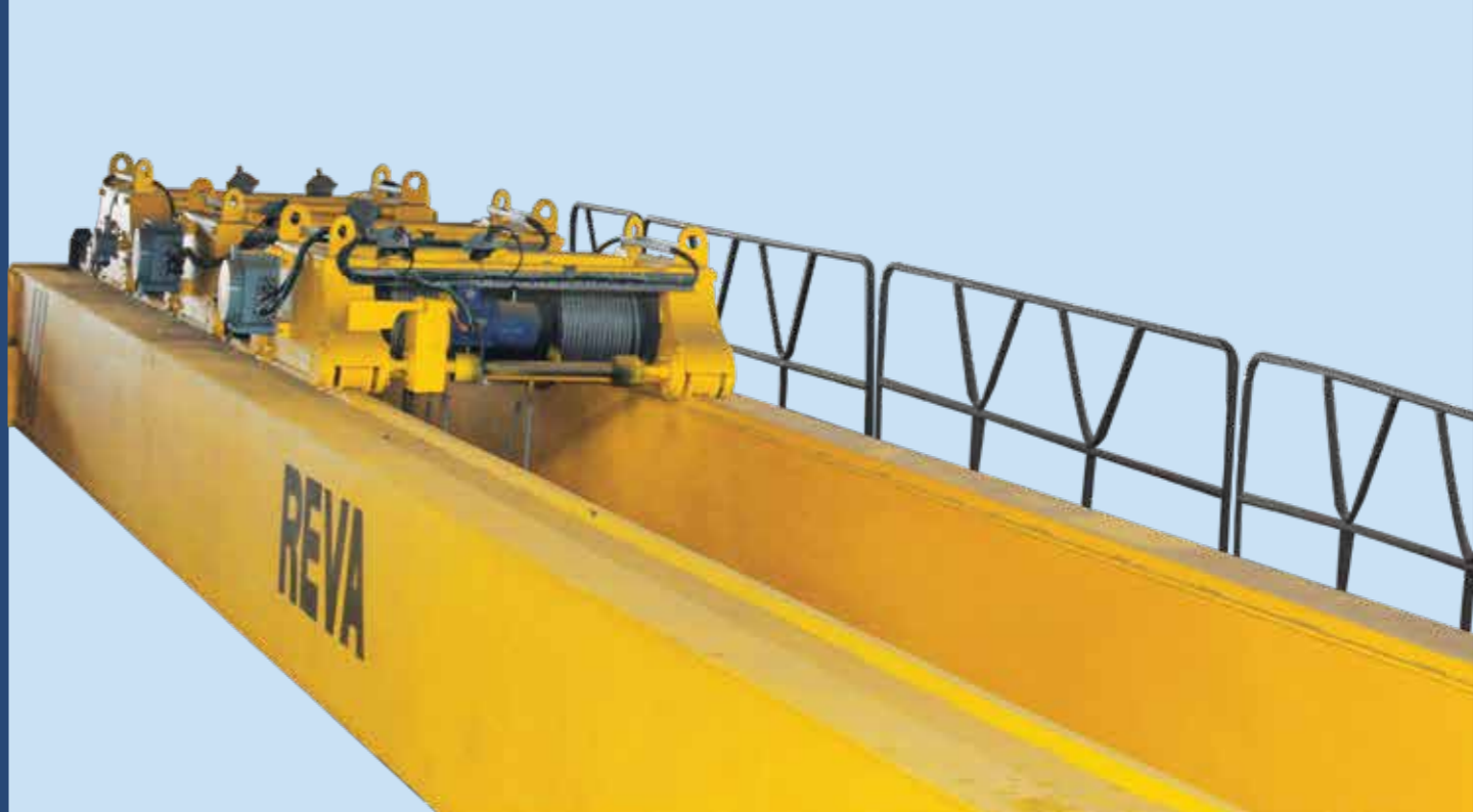
Reva Low Headroom Crane

Reva Low Head Room Crane designed to have Lower Headrooms and more Hook approaches. It is good to save on the building costs by reducing heights of the building and can cover more floor area. It also finds its use in existing buildings where overhead clearance is less and lifting height requirements are stringent. It has capacities ranging from 1 Ton to 25Ton.