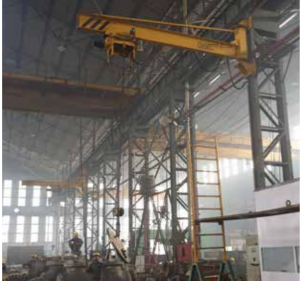
1T, 3M Boom Length for a Fabrication Shop