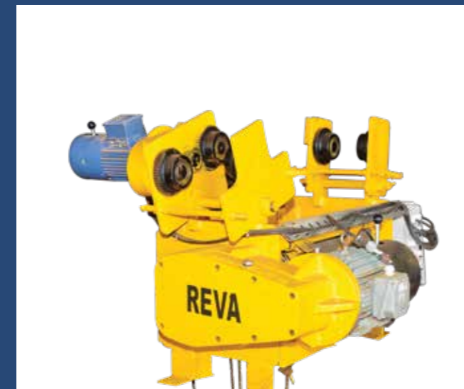
Reva Compact Hoist