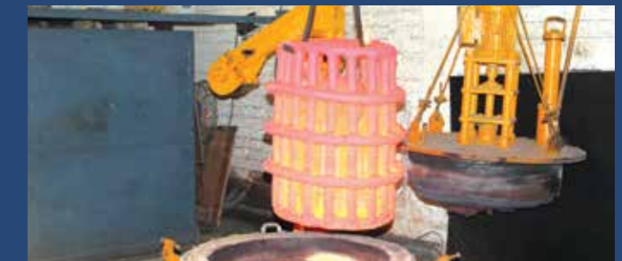
Heat Treatment Shop