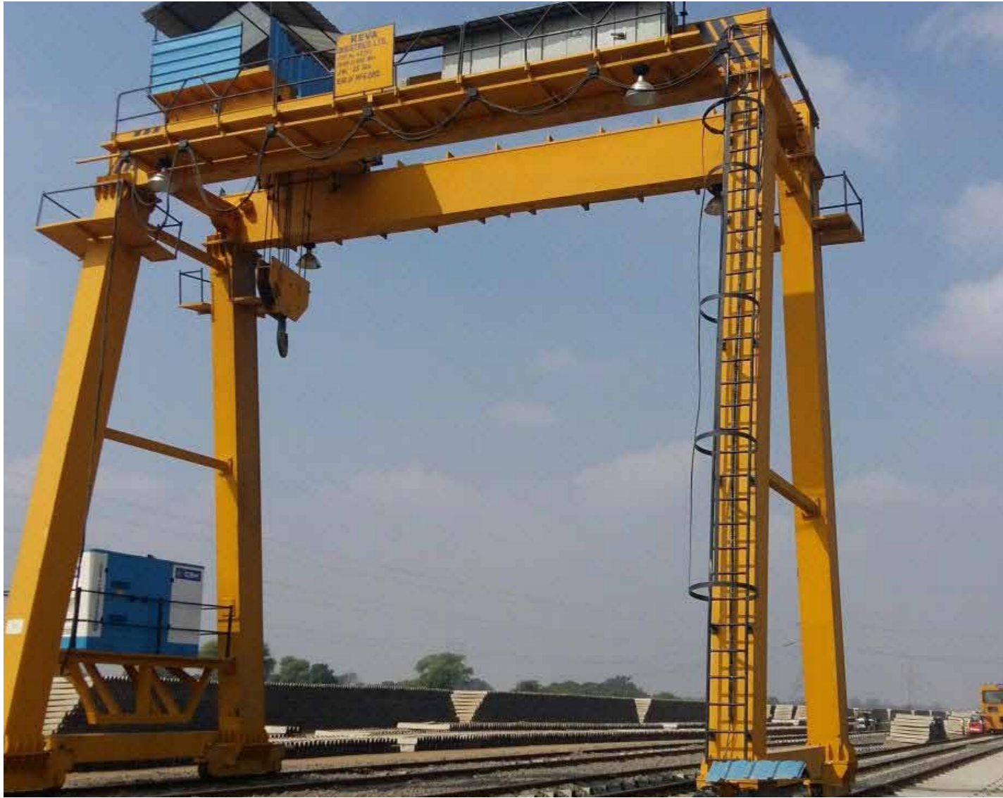
35T Goliath Crane at Tata Bhadan, DFCC

Gantry Cranes, often called Goliath Cranes or Portal Cranes, are suitable for indoor and outdoor usage. They are self standing members (they are cranes with legs), and do not require support from walls or rigid columns of buildings. They are available in a wide range of capacities between 1T till 150T. They are majorly used in open ware houses or buildings where the column or structure is weak.