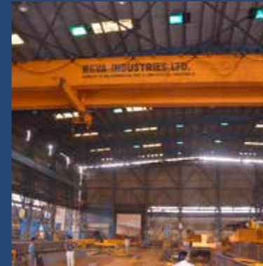
Fabrication Shop - Plant II

Reva has one of the largest machine Shops in the Crane Industry.