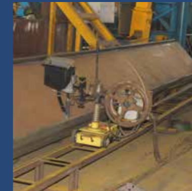
SAW Welding Shop