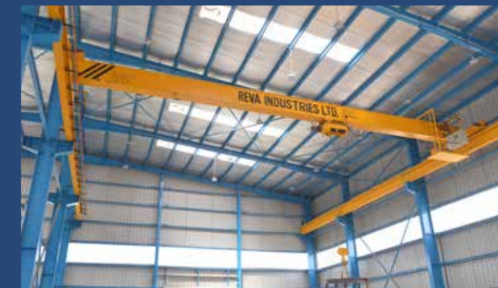
Reva Single Girder Cranes in Fabrication Shop