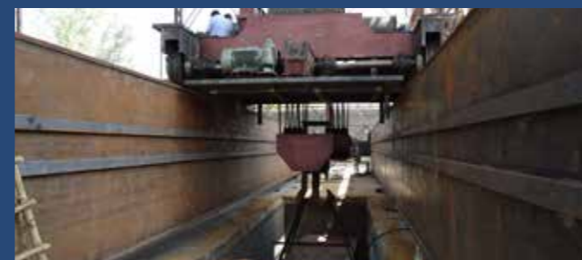
Load Testing Facility