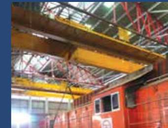
Refurbishment of old cranes