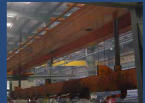
Stacker Cranes at Kirby Building Systems