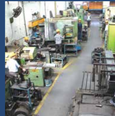
CNC Machine Shop