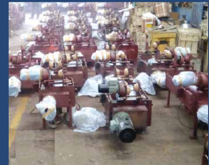
Various Capacities Electric Hoists Under Production