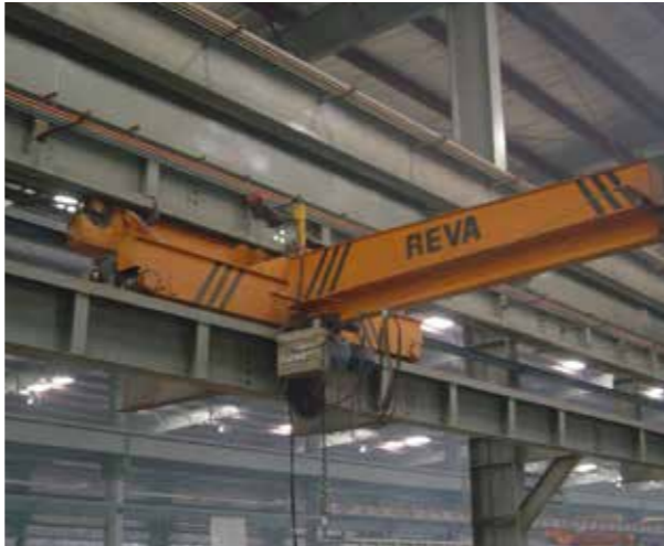
Wall Travelling Jib Crane 2T Capacity at Kirby Building